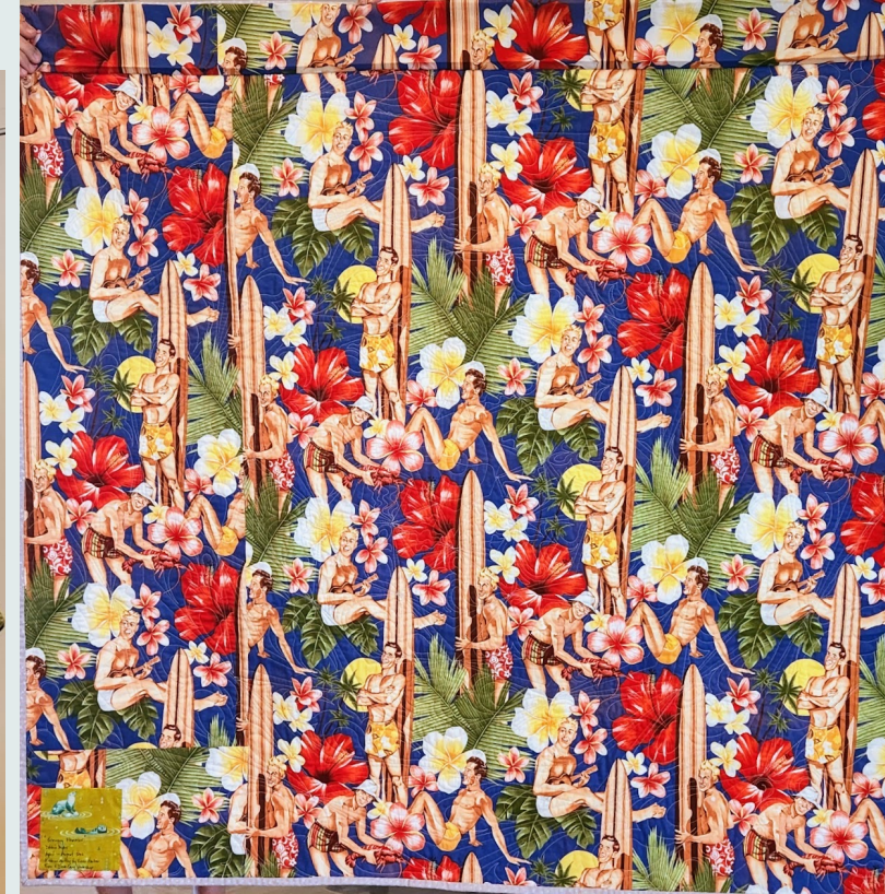
Back of the quilt